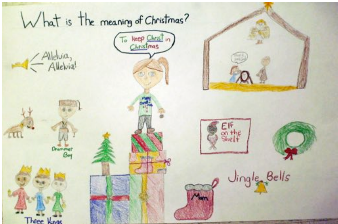
6 th Grade Winner