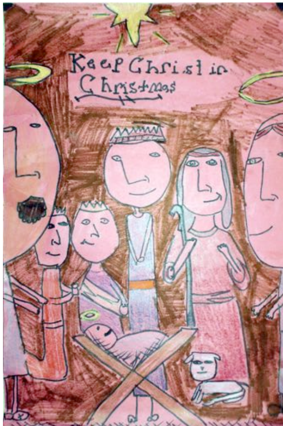
4 th Grade Winner