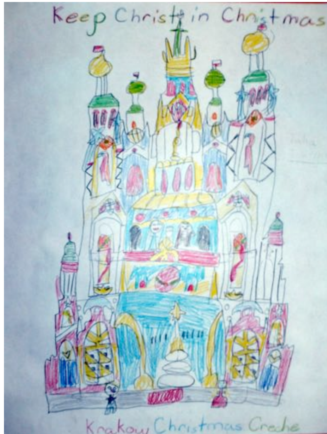
3 rd Grade Winner