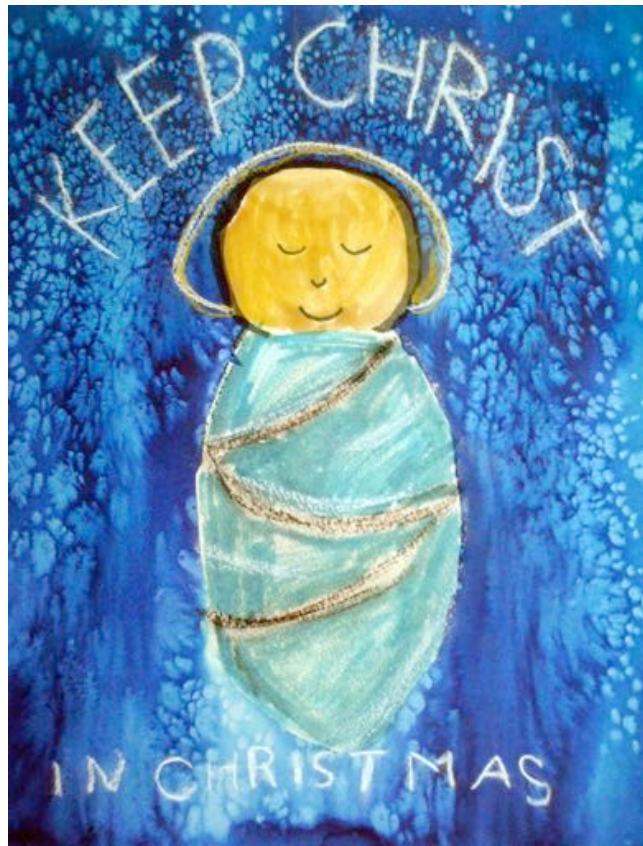
2 rd Grade Honorable Mention