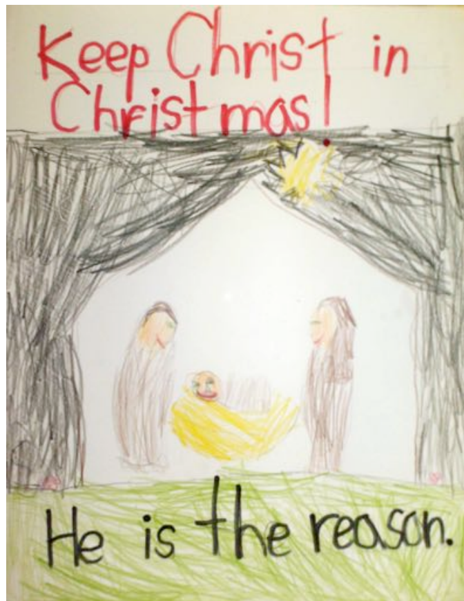
1 st Grade Winner