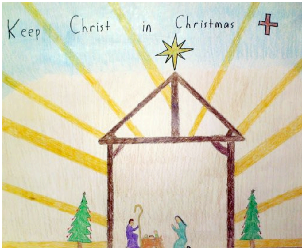
2 nd Grade Winner