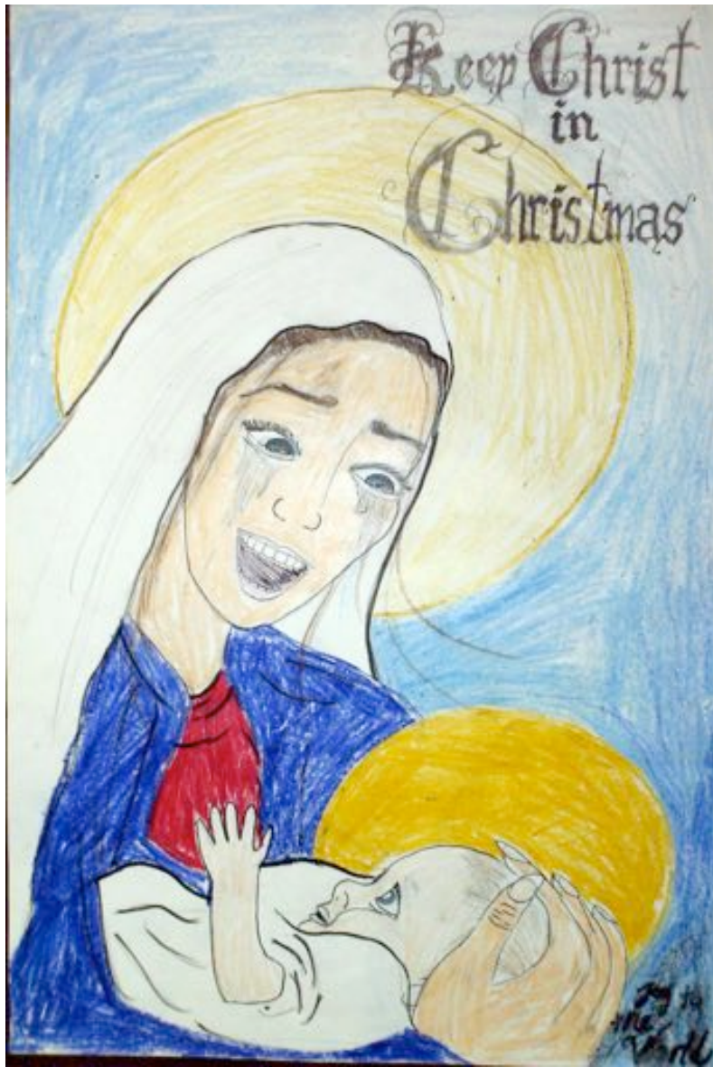
8 th Grade Winner