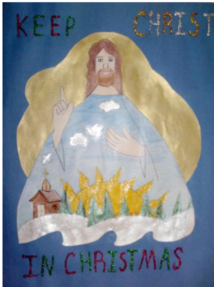
5 th Grade Winner