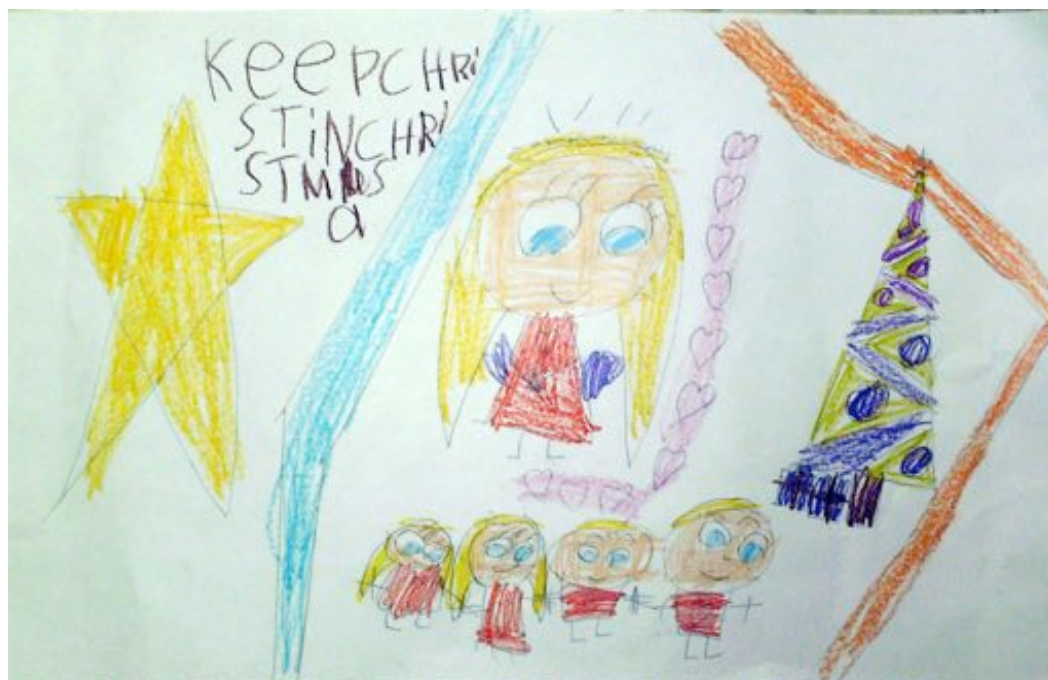
Kindergarten Honorable Mention